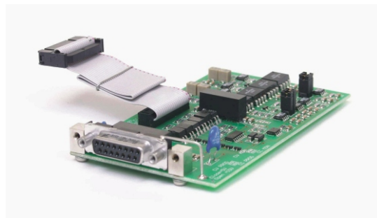
An ISO AMP CARD should be used in case of a non-floating programming source.